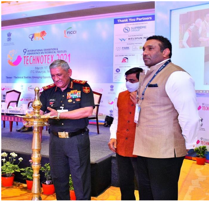
Lamp Lighting by Chief Guest General Bipin Rawat, PVS, UYS, AVS, YS, S, VS, ADC, Chief of Defence Staff, Ministry of Defence, Government of India