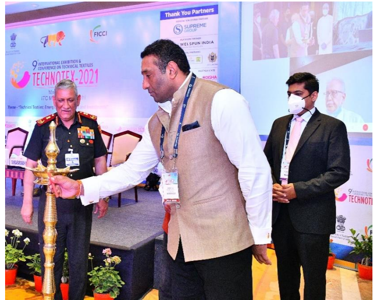
Lamp Lighting by Shri Mekapati Goutham Reddy, Hon'ble Minister of Industries, Commerce, Information Technology and Skill Development, Govt. of Andhra Pradesh